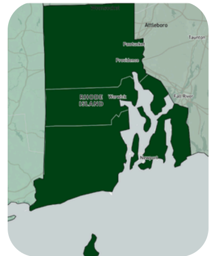
Rates of Persons Using PrEP per 100k, 2024

Every HIV transmission prevented saves $500,000 to $1.1 million in lifetime health care costs.